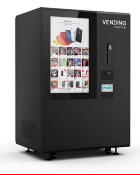
Exhibit 7: Customskins vending machine

Exhibit 5 above demonstrates the importance of the mobile phone market for NVU longer-term given the number of units in circulation.